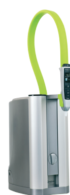
PURELAB flex 3&4