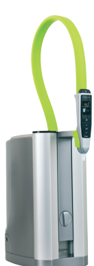
PURELAB flex 3&4