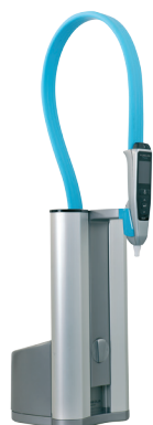
PURELAB flex 1